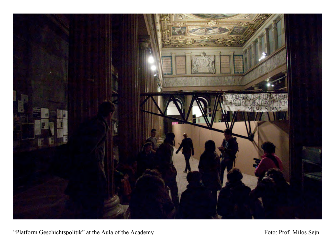
"Platform Geschichtspolitik" at the Aula of the Academy