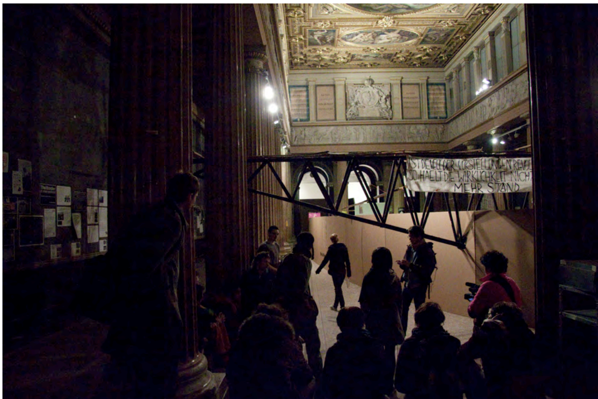
“Platform Geschichtspolitik” at the Aula of the Academy