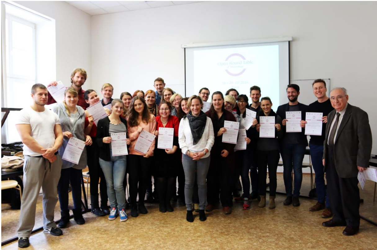
Second educational excursion to Brno City Museum on 20th of October