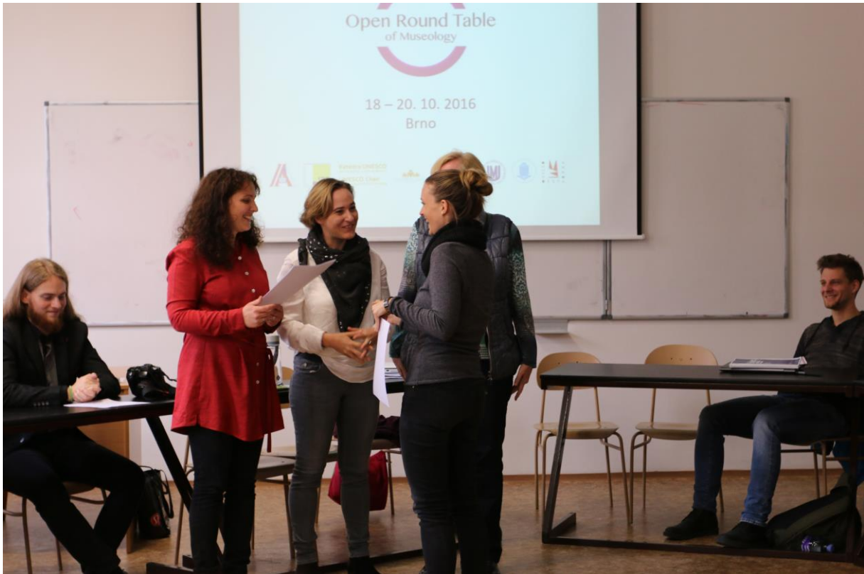
Participants after closing ceremony