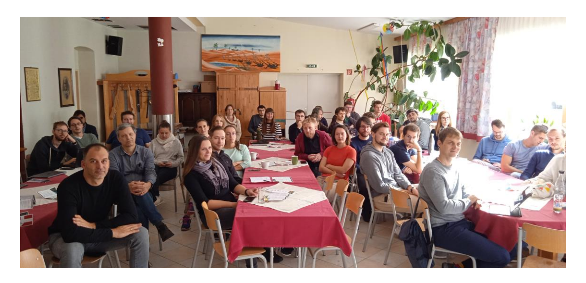
AKTION 2022: During scientific session