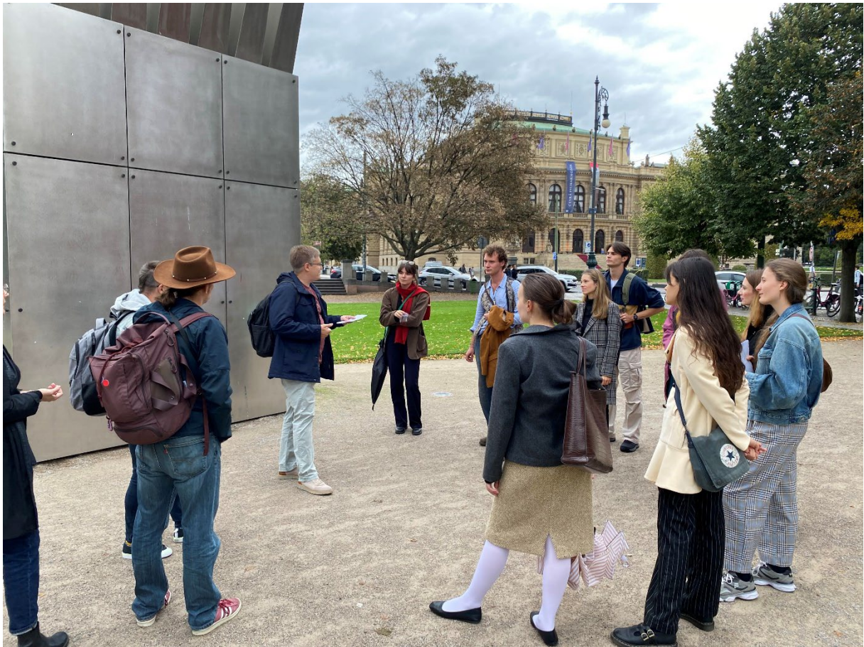
Workshop 2 – walk