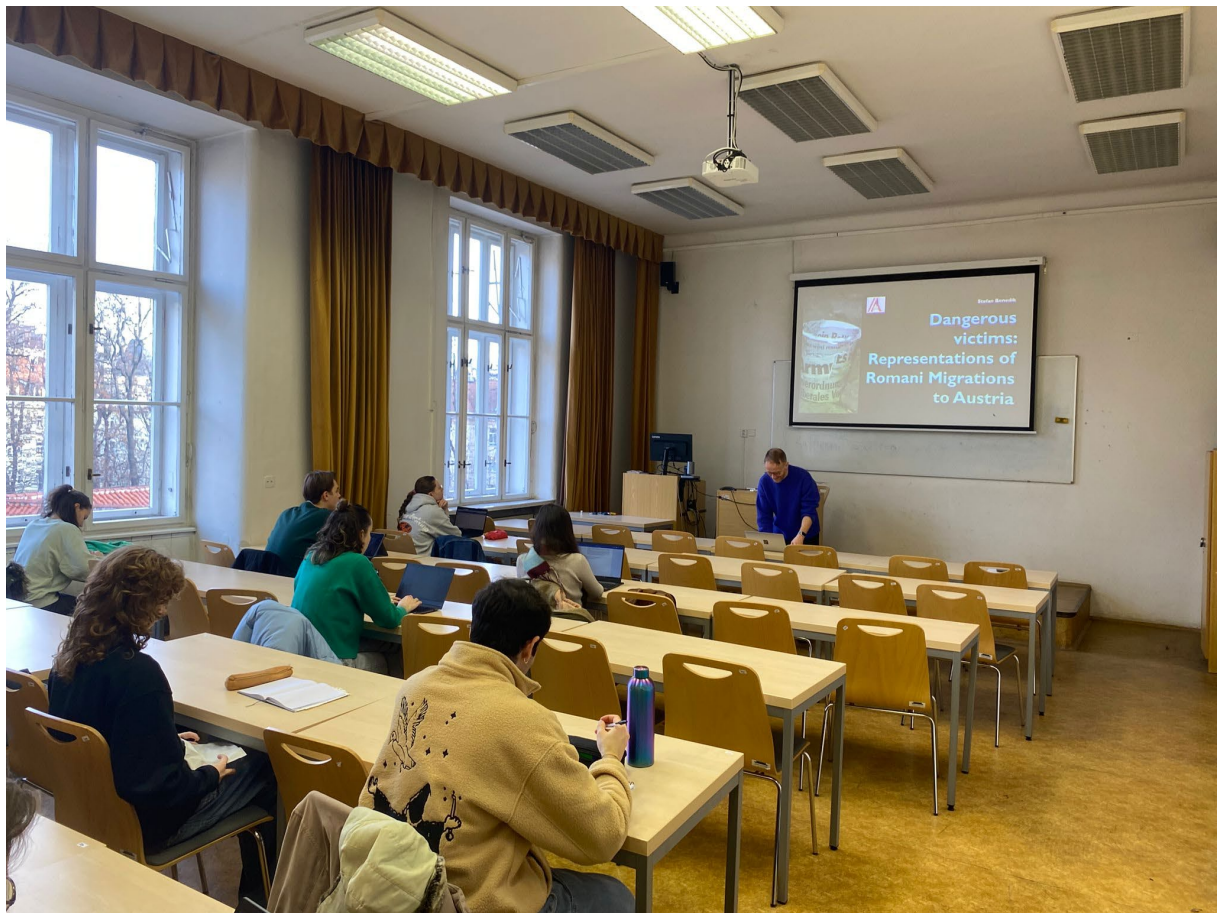
Workshop 3 – Charles University