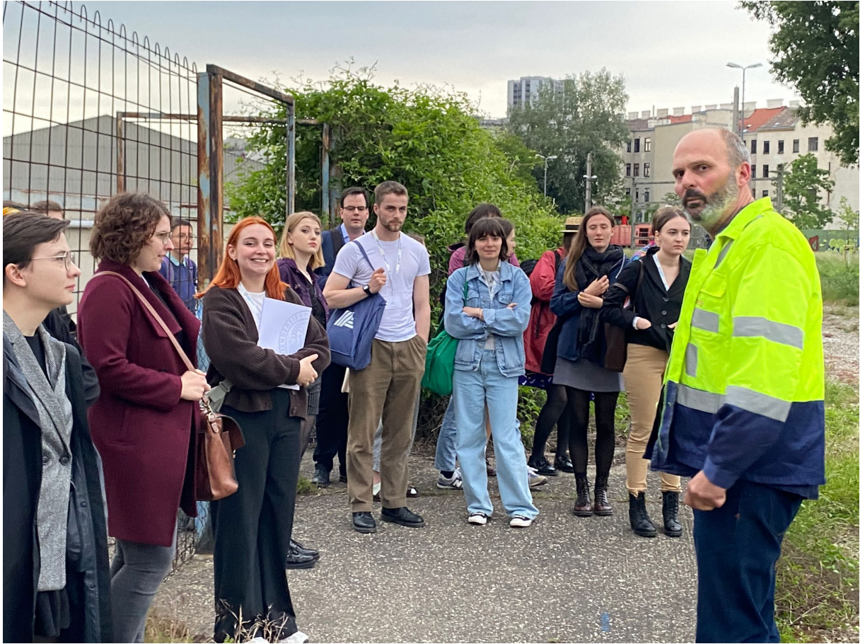
Workshop 1 – walk