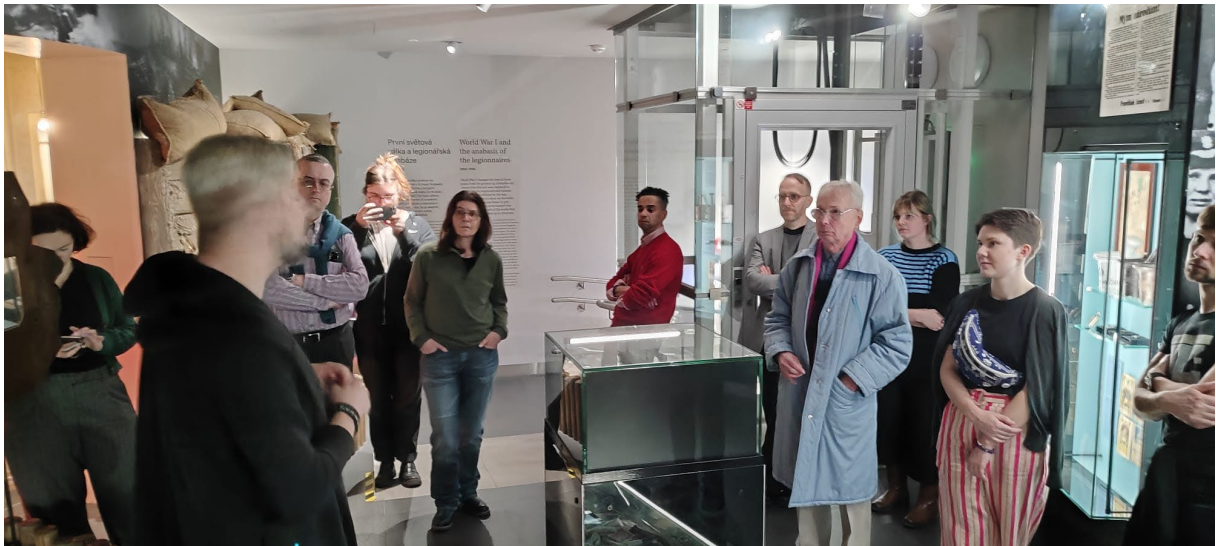
Workshop 3 – National Museum