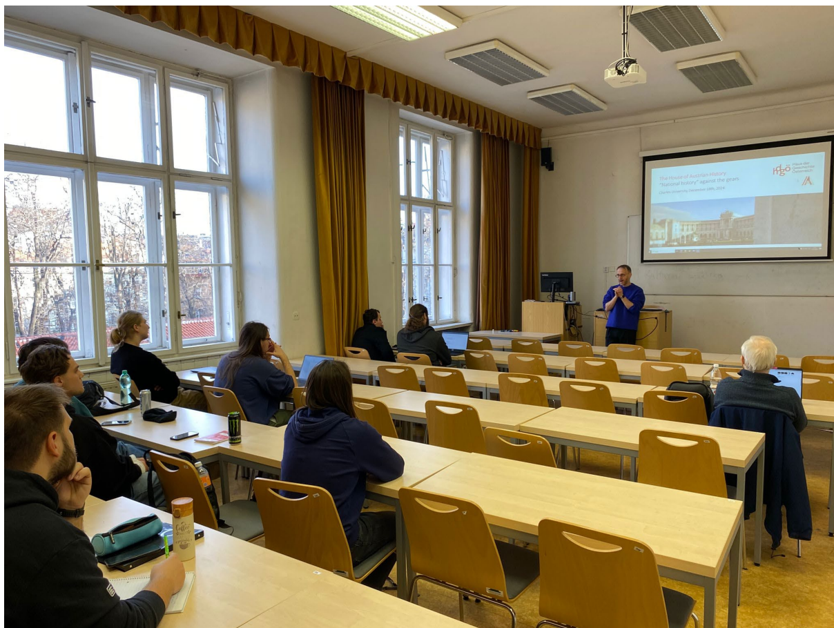
Workshop 3 – Charles University