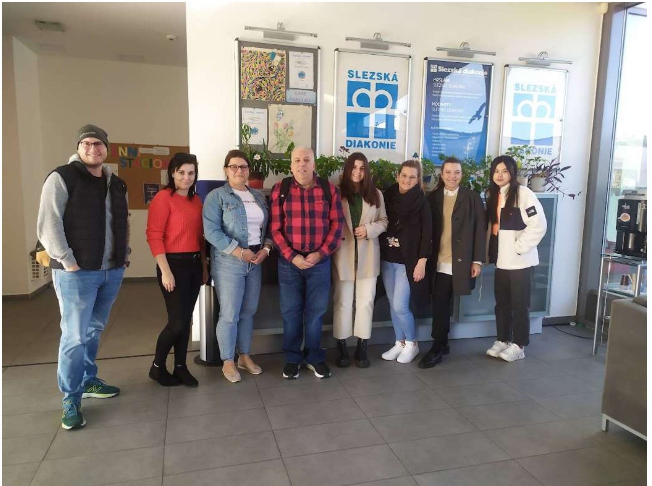
1st visit in organization