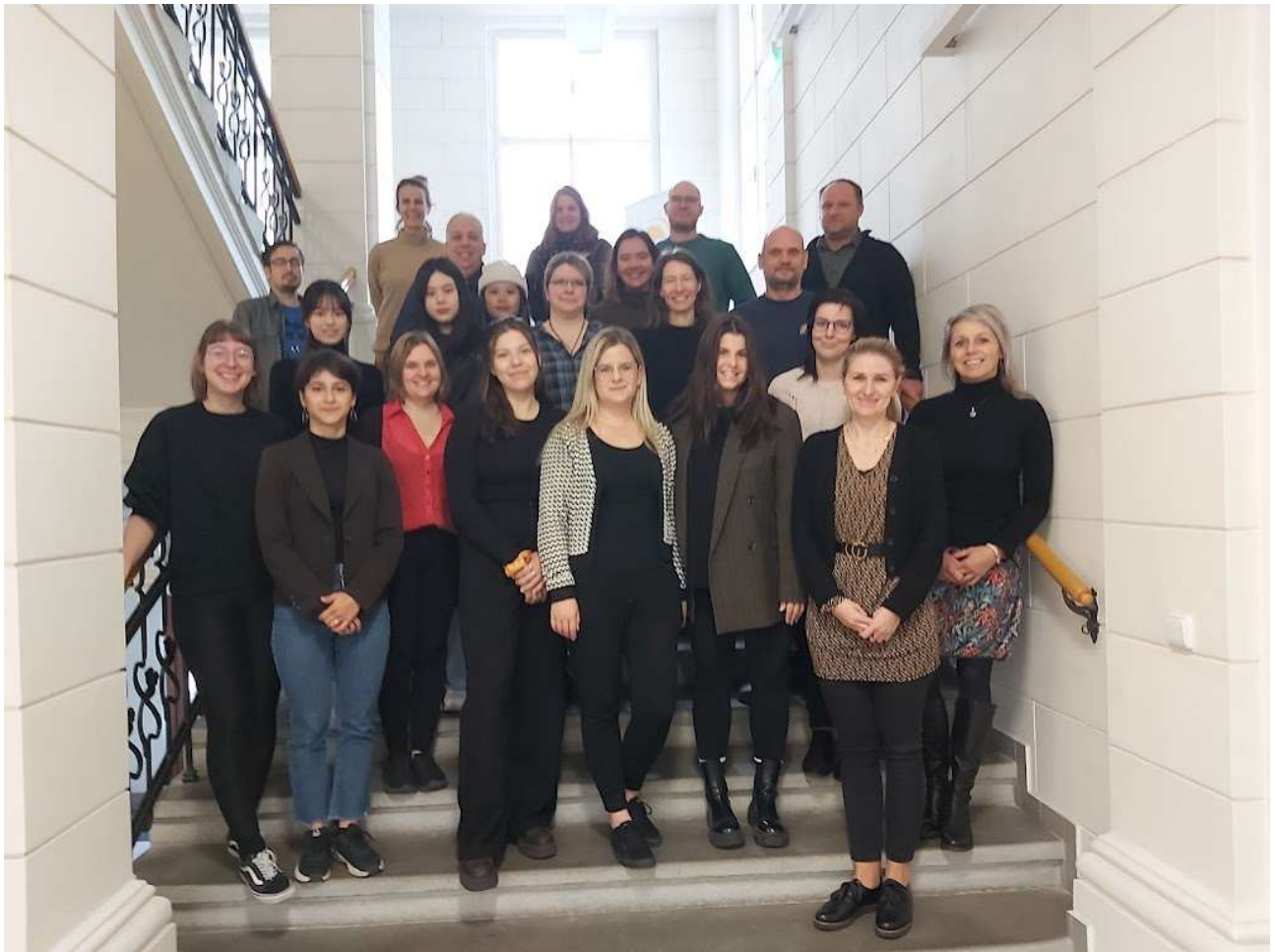
The ICPM team