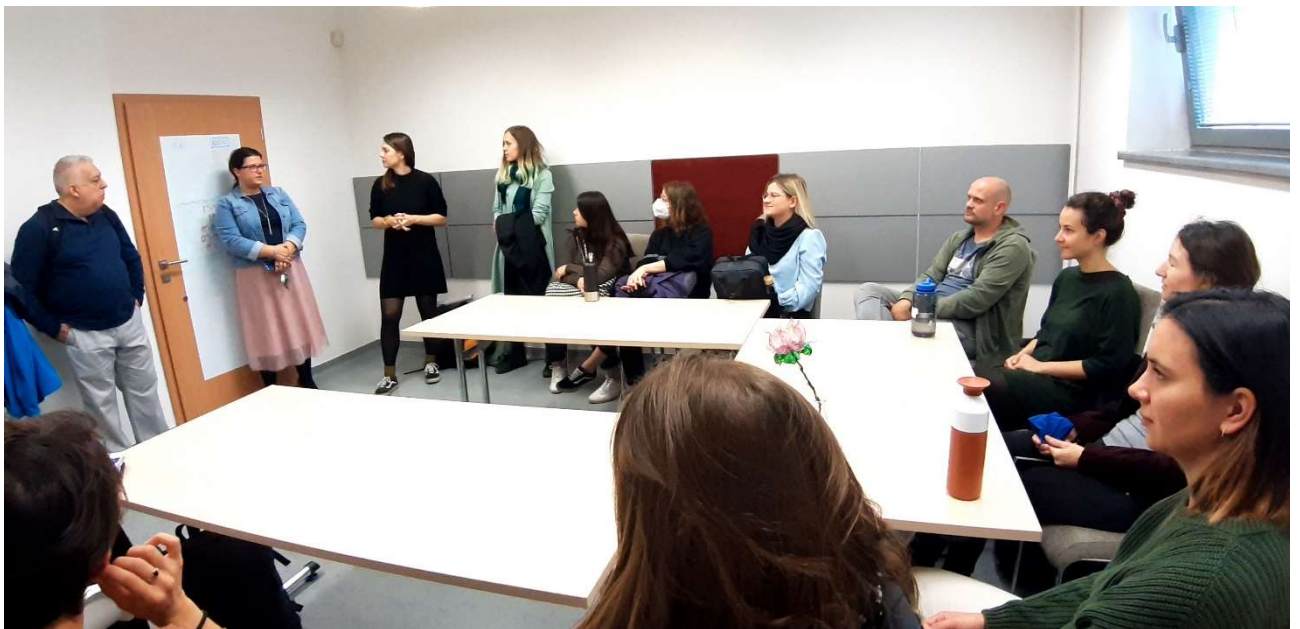
1st visit in organization Rainbow House