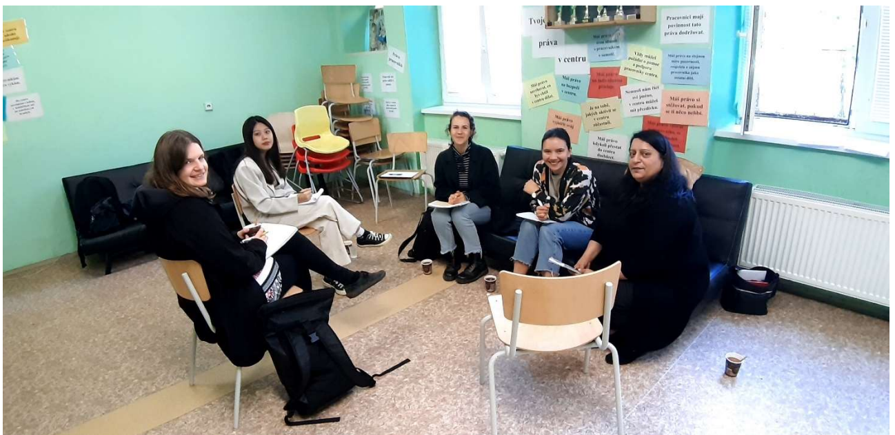
Community work team 2nd visit in organisation