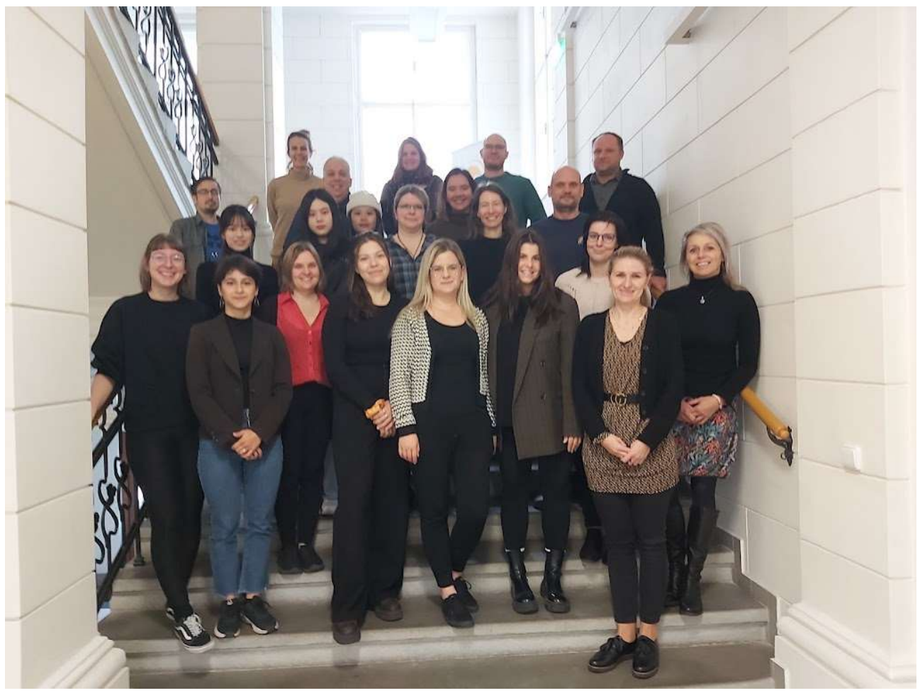
The ICPM team