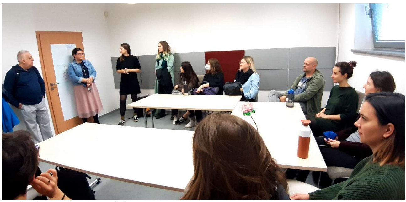
1st visit in organizaction Rainbow House