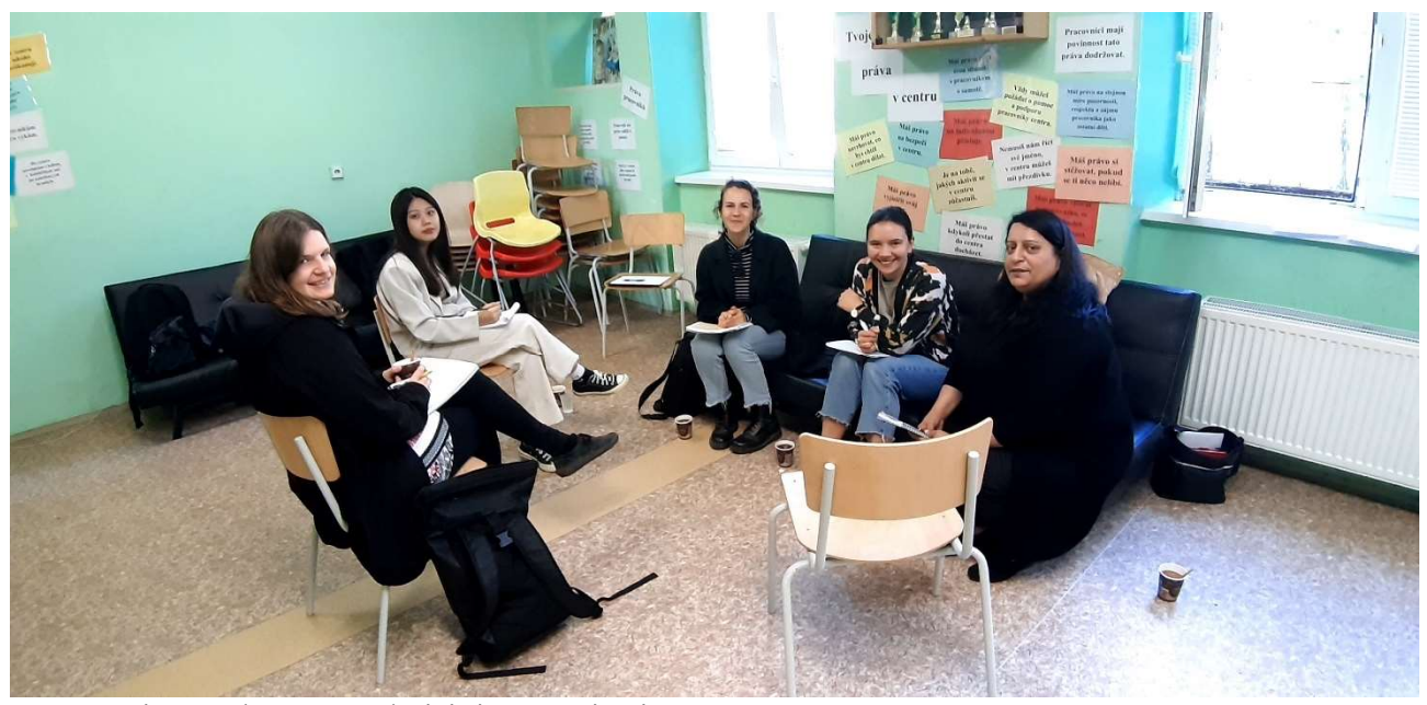
Community work team 2nd visit in organisation