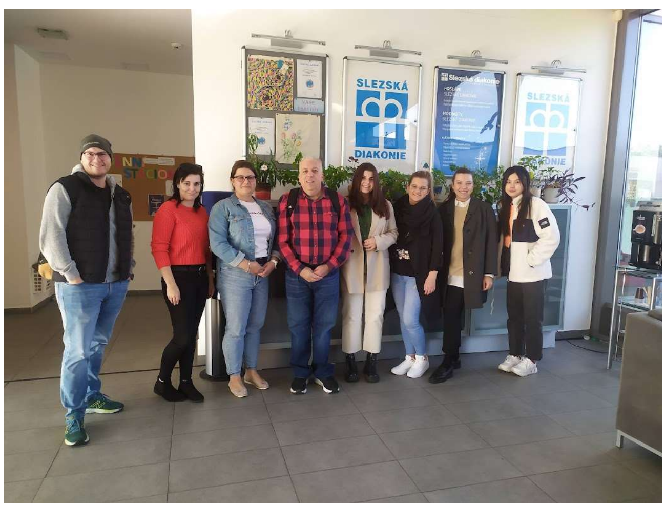
1st visit in organizaction