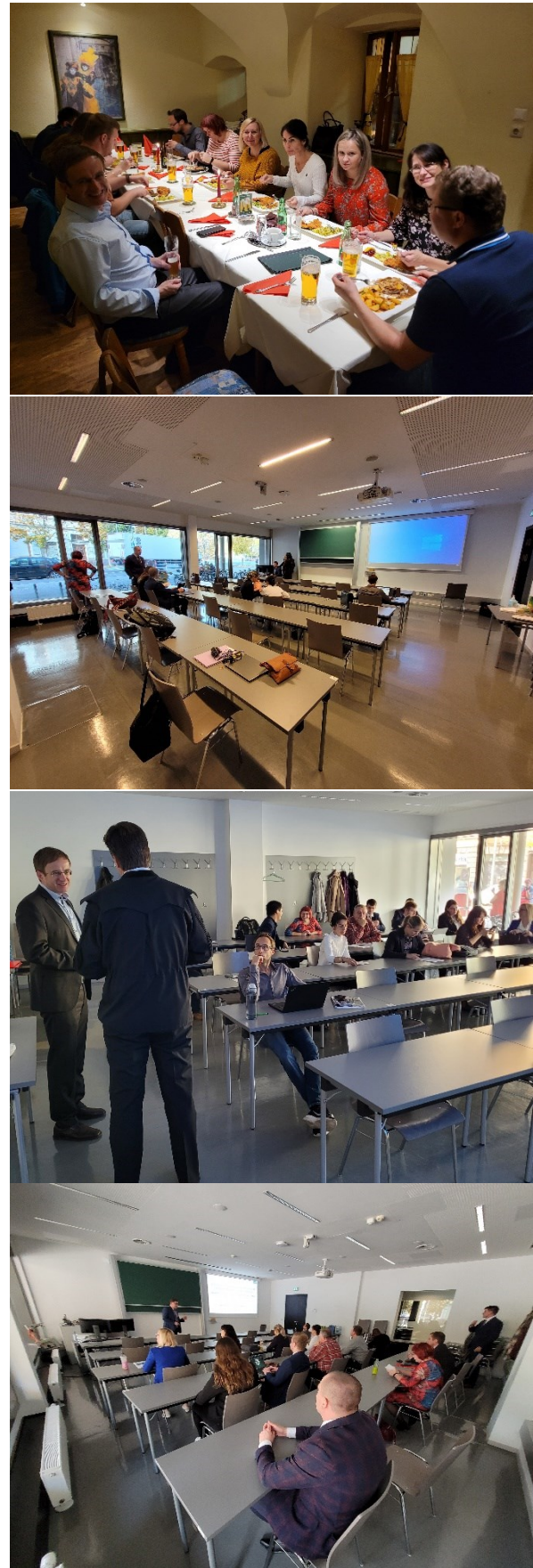
Fig.2 Lectures at Montanuniversität Leoben